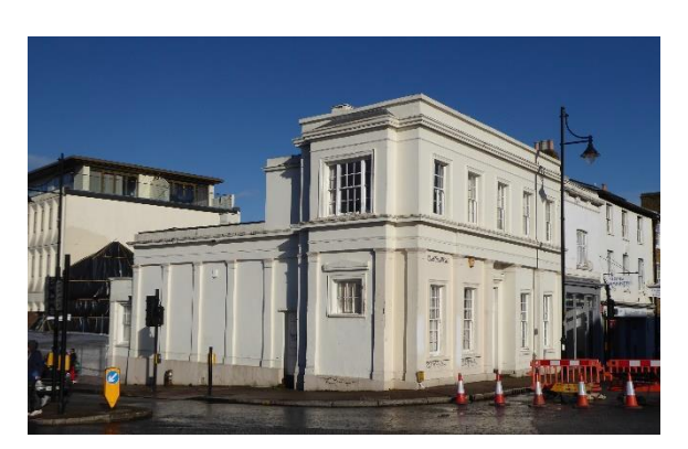
41 Clarence Street