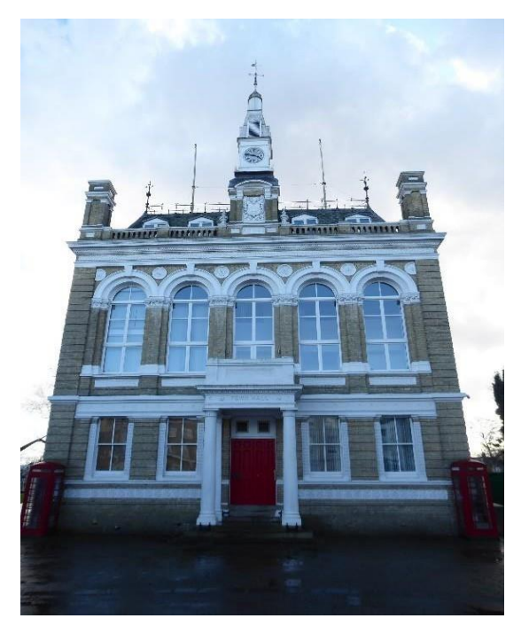
The 1880s Town Hall now converted to flats