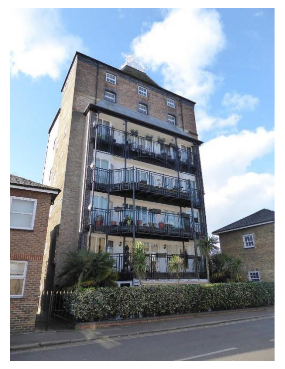
The Brewery Tower, Church Street

is earlier and is believed to date from the late 18<sup>th</sup> century. It has been attributed to Inigo Jones, although there is no definitive evidence proving this. The Church is located on elevated ground at the western extremity of the town. The construction of the Church during the 19<sup>th</sup> century was a physical expression of the perceived spiritual health of the town at a time of significant development and would have complimented the equally confident expressions of civic