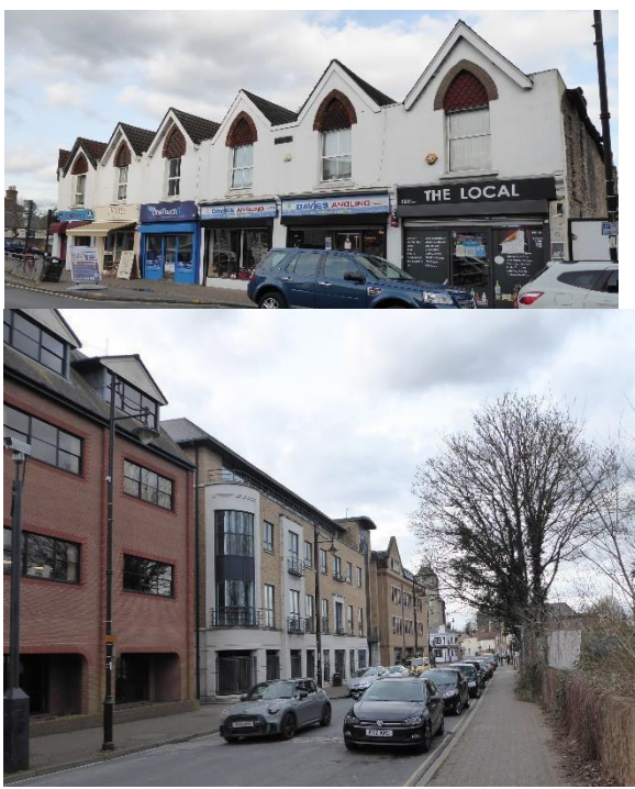
View looking north-westwards along Church Street including Church House and Charta House developments