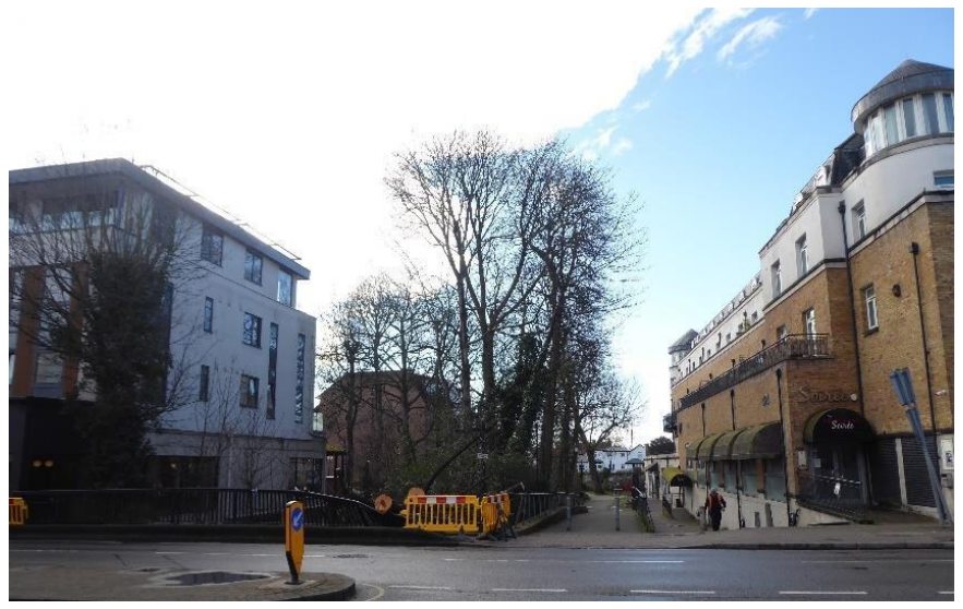
The River Colne on the south side of Clarence Street which can be seen by the row of trees

• Views along Clarence Street from west to east are terminated by the former Debenhams building. This building shares many of the features characteristic of the historic buildings in this Character Area in terms of scale, string rhythm, architectural