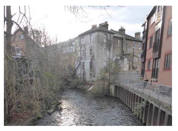
View along the River Colne to the rear and 25 and 27 Clarence Street

Buildings range in height between two and three storeys and sit beneath hipped and gabled roofs