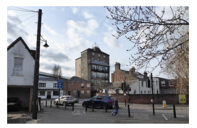
Views looking south-westwards from Hale Street towards Brewery Tower

• Views south-westwards along Hale Road back towards the historic core of the town are dominated by the Brewery Tower;