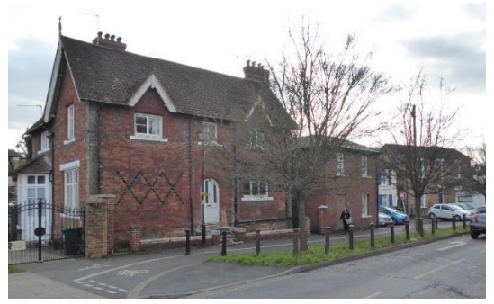
Number 24 and 26 Hale Street.