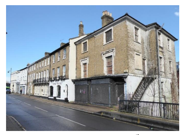
View looking west towards early 19<sup>th</sup> century buildings lining northern side of Clarence