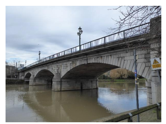
Staines Bridge constructed in 1832

There have been a number of bridges built across the River Thames, the first post-Roman reference to a bridge dates from 1222. In 1791 a stone bridge was constructed, but collapsed soon after completion. All the bridges prior to the construction of the present structure in 1832 were located between what is now the Memorial Gardens and The Hythe on the opposite riverbank and were accessed via the High Street which stretched across the site of the present Town Hall. The present stone bridge, designed by George Rennie and John Rennie the Younger, was