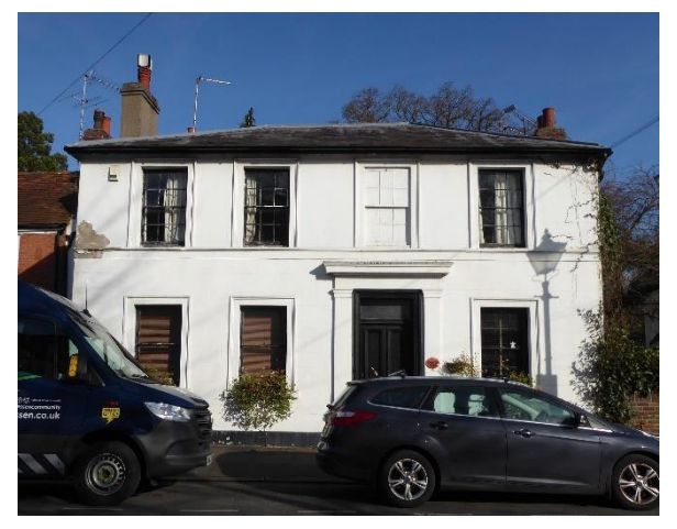
Stainton House, 101 Church Street

during and prior to this era. Those pre-19<sup>th</sup> century buildings that do survive are primarily concentrated along Church Street. Development during the 19<sup>th</sup> century significantly altered, much of the earlier town. The construction of the existing stone bridge in 1832, saw some reconfiguration of road layouts with the creation of Clarence Street and Bridge Street.