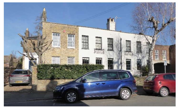
111 to 113 Church

century elements and 21 to 27 Church Street which are a much-altered short row of buildings with 17<sup>th</sup> century origins. A handful of 18<sup>th</sup> century buildings survive which are mainly concentrated along Church Street and close to the church. Examples include Corner Hall, Bosun's Hatch, 57 and 59 Church Street and 114 Church Street. The majority of the buildings of 18<sup>th</sup> century origin are either detached or form short rows and are constructed of red or buff-coloured bricks; others are rendered. In height they range between two and three storeys and present relatively regular, principal elevations with timber sash windows. Roofs are gabled or hipped and laid in slate or tile. A number have parapets.