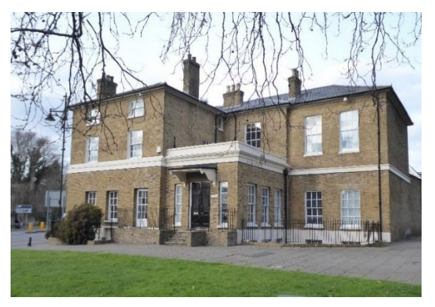
Former Staines West Station