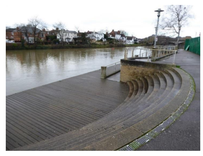
Canopy and steps leading to the boat deck