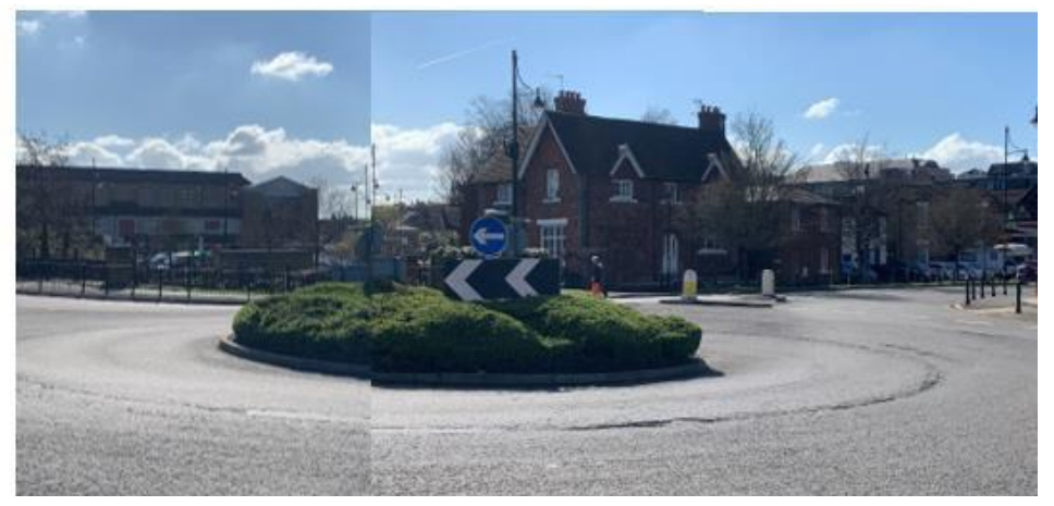
Numbers 24-26 Hale Street with the backdrop of the Two Rivers Shopping Centre affecting its setting

• Views south-westwards along Hale Road back towards the historic core of the town are dominated by the Brewery Tower;