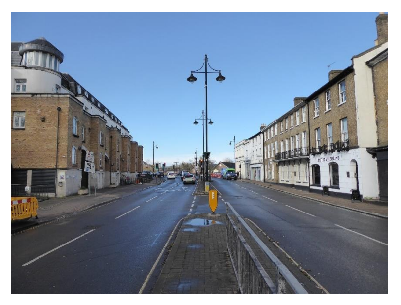
View looking south down Clarence Road towards the Thames