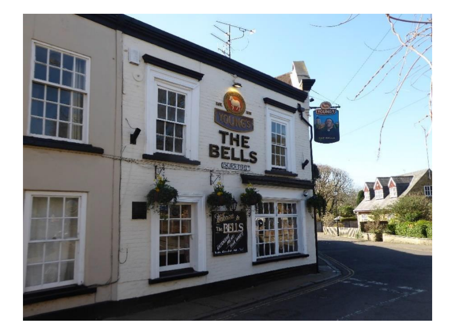
The Bells, Church Street, an early example of a Coaching Inn

Rivers have had a significant impact on the history of Staines and were important for transportation, communication and for industry. The town marked the western-most extremity of the City of London's jurisdiction over the River Thames. The Rivers Colne, Ash and Wraysbury were important for the establishment of several mills within the town. In the late 18<sup>th</sup> century Thomas Ashby established a brewery in Staines which utilised the water from the River Colne. The brewery was located in Church Street and although closed in 1936, the 19<sup>th</sup> century brewery tower still survives and forms a major landmark in Staines' skyline.