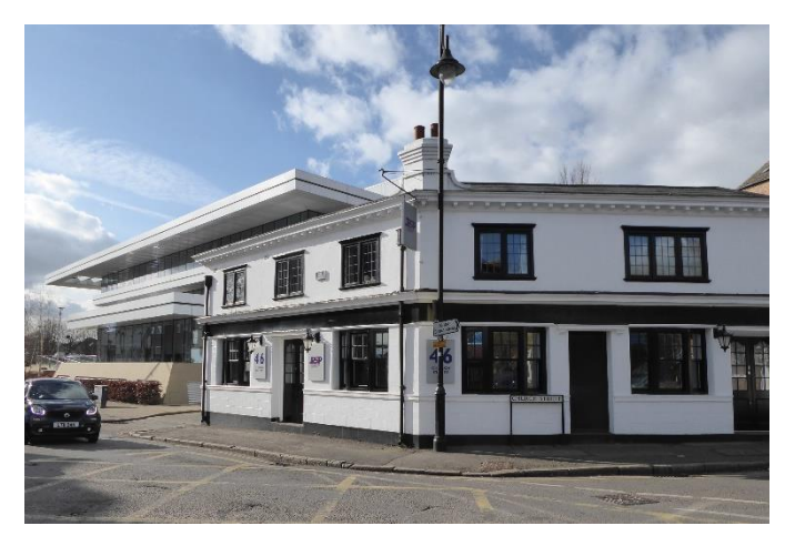
46 Church Street and ServiceNow UK&1, Bridge Street

However, the juxtaposition of new and old does work successfully in Staines where care has been taken to reflect elements of the historic built environment. An interesting example of such a relationship is the modern 'Service Now UK&I building' on Bridge Street which, although large in scale and dominant in the streetscape, has a strong emphasis on the horizontal line and a white elevation which picks up the same characteristics of its neighbour, 46 Church Street, a former early 19<sup>th</sup> century public house.